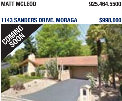
JON WOOD PROPERTIES