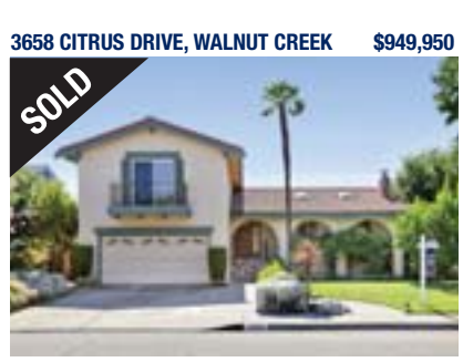
TERESA ZOCCHI TEAM BRENTWOOD

60 EAGLE ROCK WAY, SUITE B BRENTWOOD, CA 94513 O: 925.420.5717 F: 925.937.4001