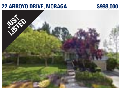
JON WOOD PROPERTIES