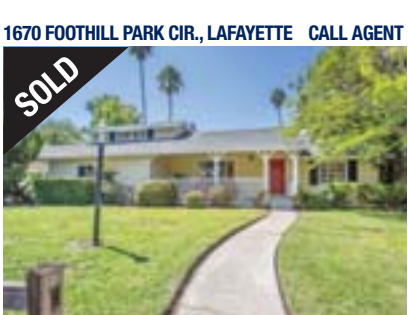
JON WOOD PROPERTIES